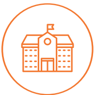
Schools and universities