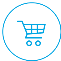
Retailers and shopping malls