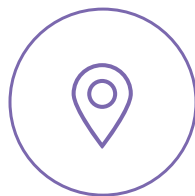
Iconic sites and tourist attractions