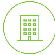
Hotels and hospitality