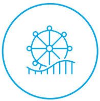
Amusement parks and leisure attractions

Active assailant attacks are a real and present threat with new incidents being reported with growing frequency. They can occur in all types of businesses and organisations; however those exposed to people aggregation are most at risk.