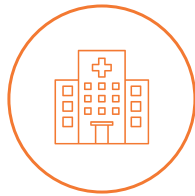
Hospitals and healthcare facilities